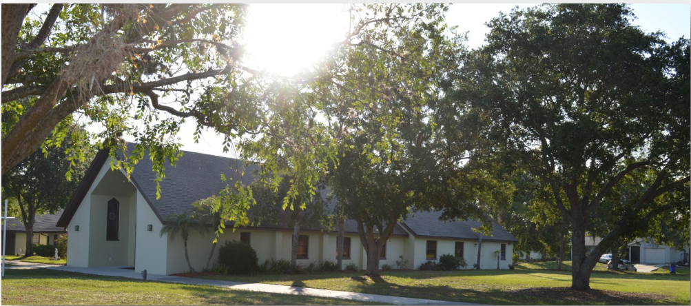
St. Elizabeth’s Sanctuary

“Heaven measures success by what a man does for others, not by what they do for him” Matthew 20:26