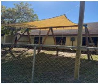
In December a new Shade was installed on our new Swing Set