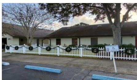
St. Elizabeth's beautifully decorated for Christmas!